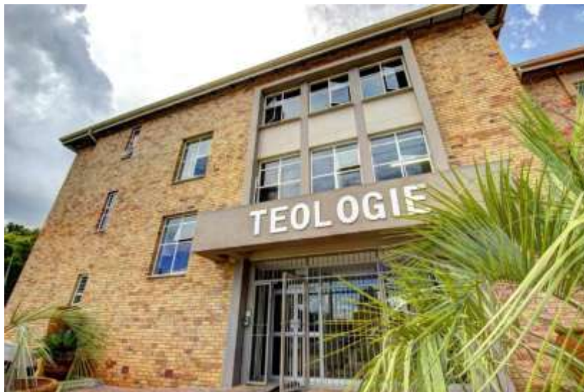
New Theology Building (K23) Faculty of Theology, North-West University, Potchefstroom

All plenary sessions will be held in the conference centre (Room 204) of the New Theology Building (K23) situated off of Molen Street (between Boucherd Street and Meyer Street), Potchefstroom, North-West Province.