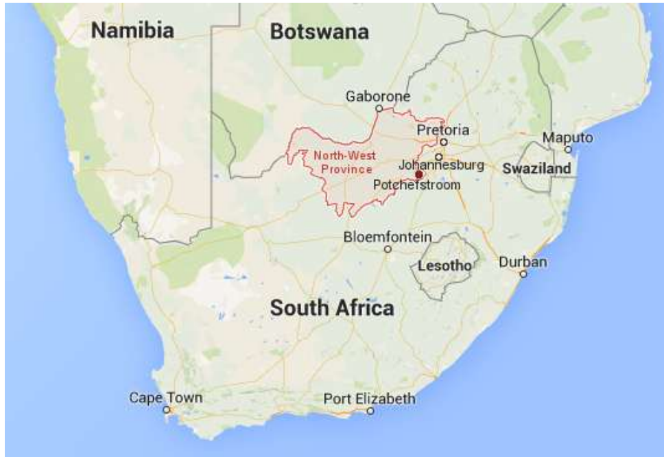
North-West Province, South Africa