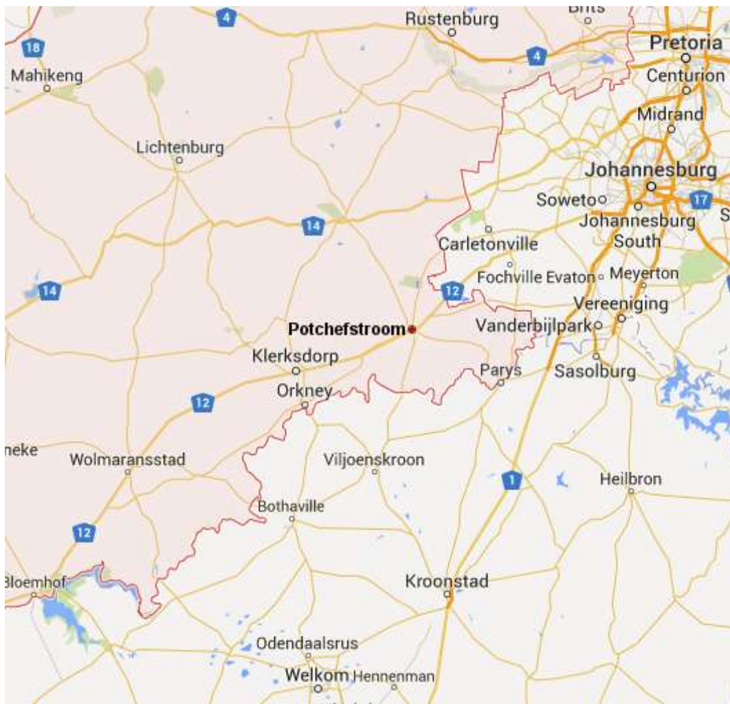
Potchefstroom, North-West Province