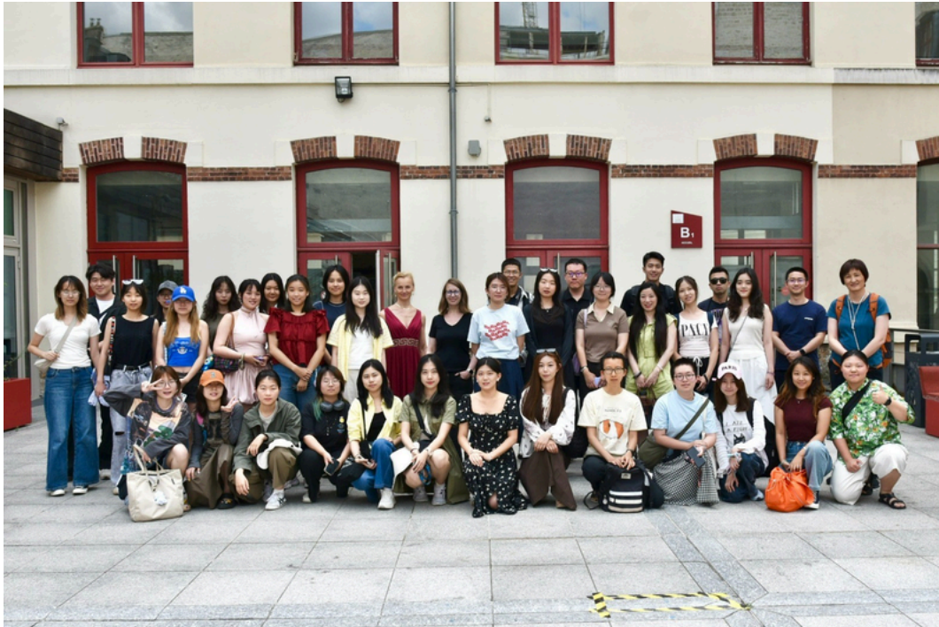
fig. Summer School 2025

FOR APAC International Austrian-EU Summer School 2026