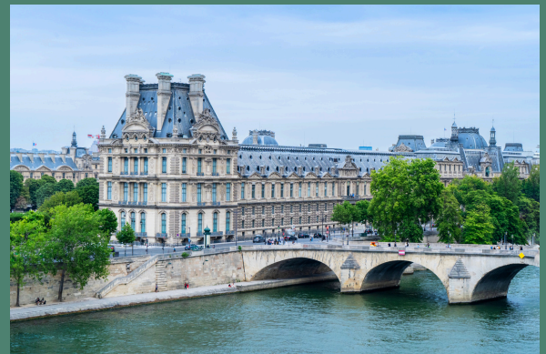
fig. Musée d'Orsay & Seine river