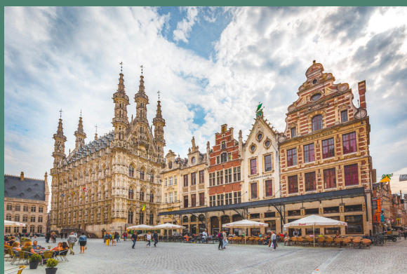
fig. Historic City, Leuven