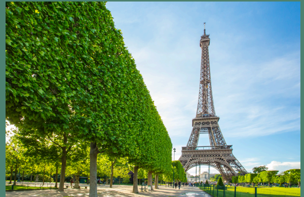
fig. Eiffel Tower