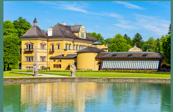
fig. Castle Hellbrunn