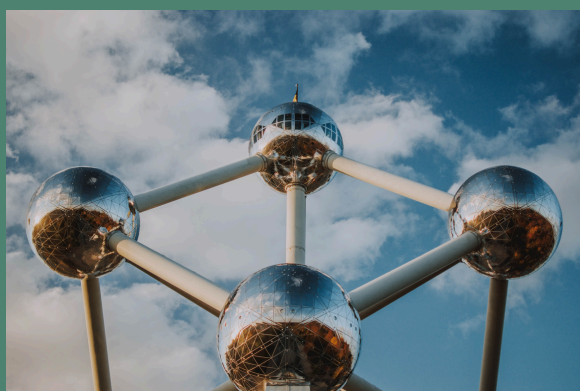
fig. Atomium, Brussels

Leuven Irish College Leuven | Janseniusstraat 1 | 3000 Leuven | Belgium TEL.: +32 (0)16 310 430