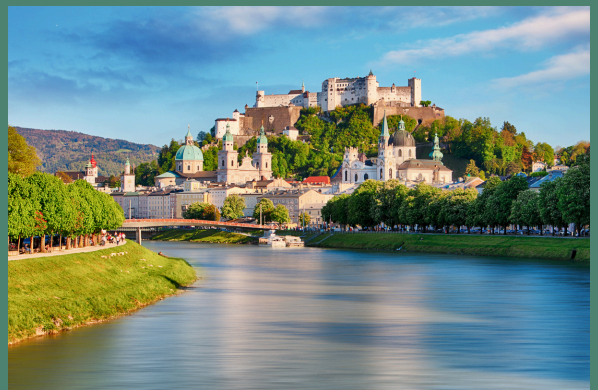
fig. Salzach river & Fortress Hohensalzburg