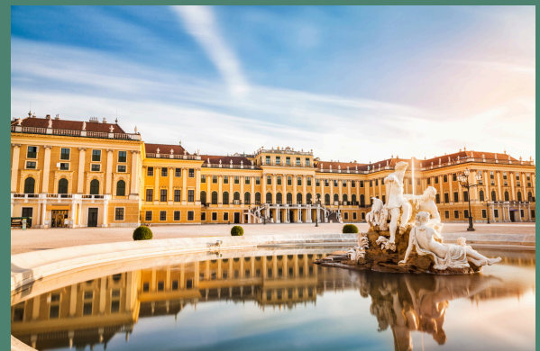
fig. Castle Schönbrunn