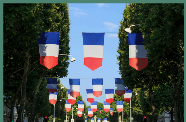
fig. Bastille Day / French National Day

Paris Hotel Ibis Bastille Opéra 15 Rue Bréguet | 11 Arrondissement | 75011 Paris | France Tel.: +33149292020