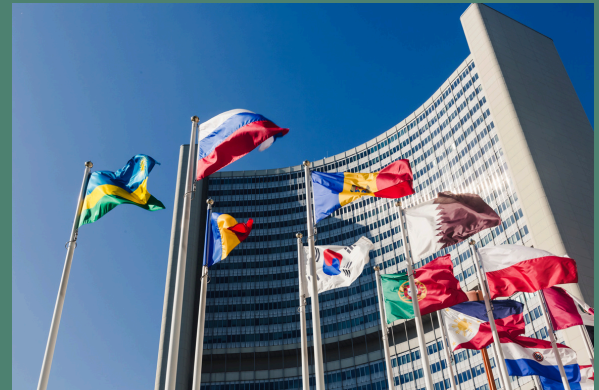
fig. United Nations Building Vienna