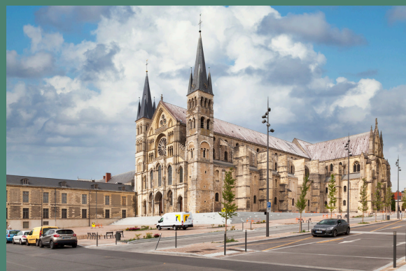
fig. Basilica of Saint-Remi