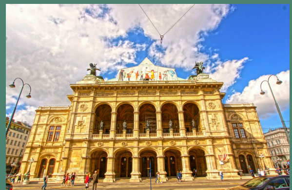
fig. Vienna Opera House