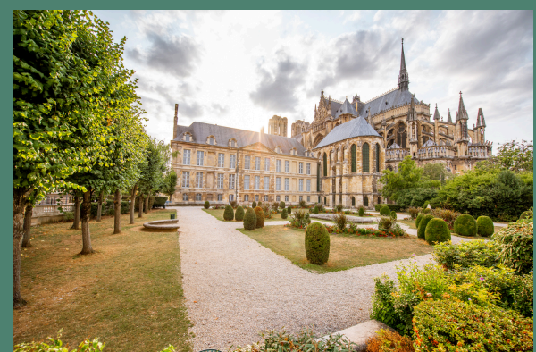
fig. Gardens of the Reims Cathedral

Reims Hotel Campanile Reims Centre | Cathédrale 27 DB Paul Doumer | 51100 Reims | France TEL.: +33 3 26400108