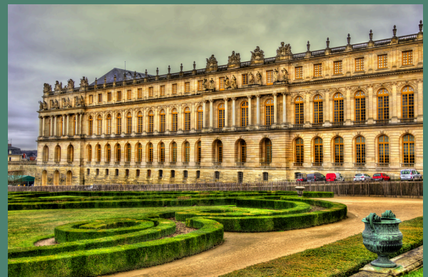
fig. Palace of Versailles