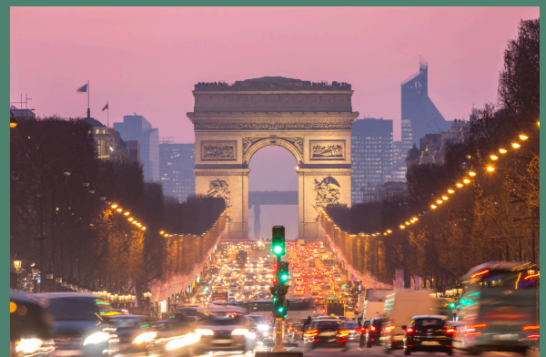
fig. Champs-Élysées & Arc de triomphe