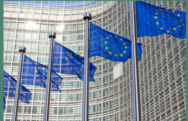
fig. EU Commission Building